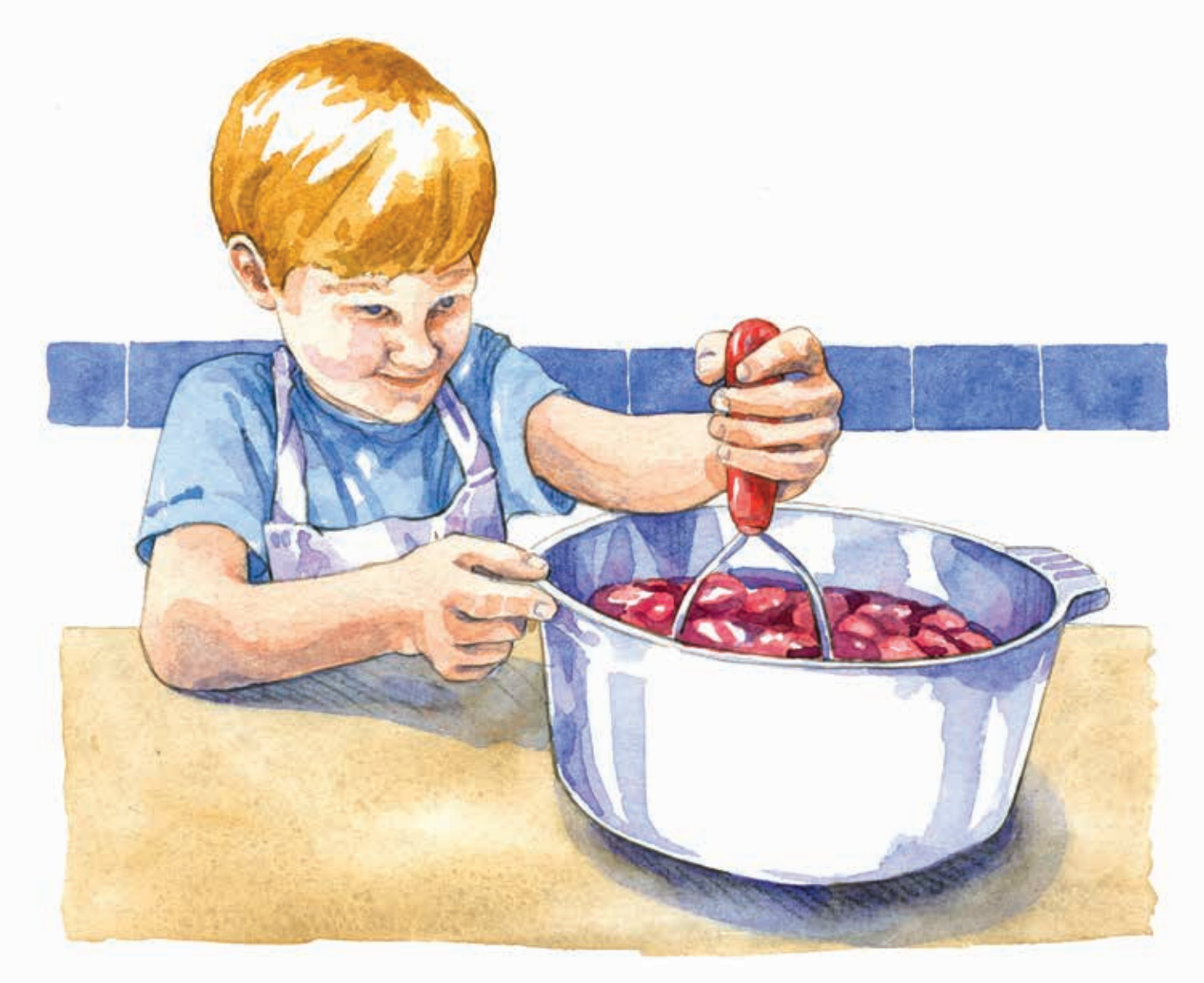
Smack and smash them. Are your plums like mush? Is the mush very red?