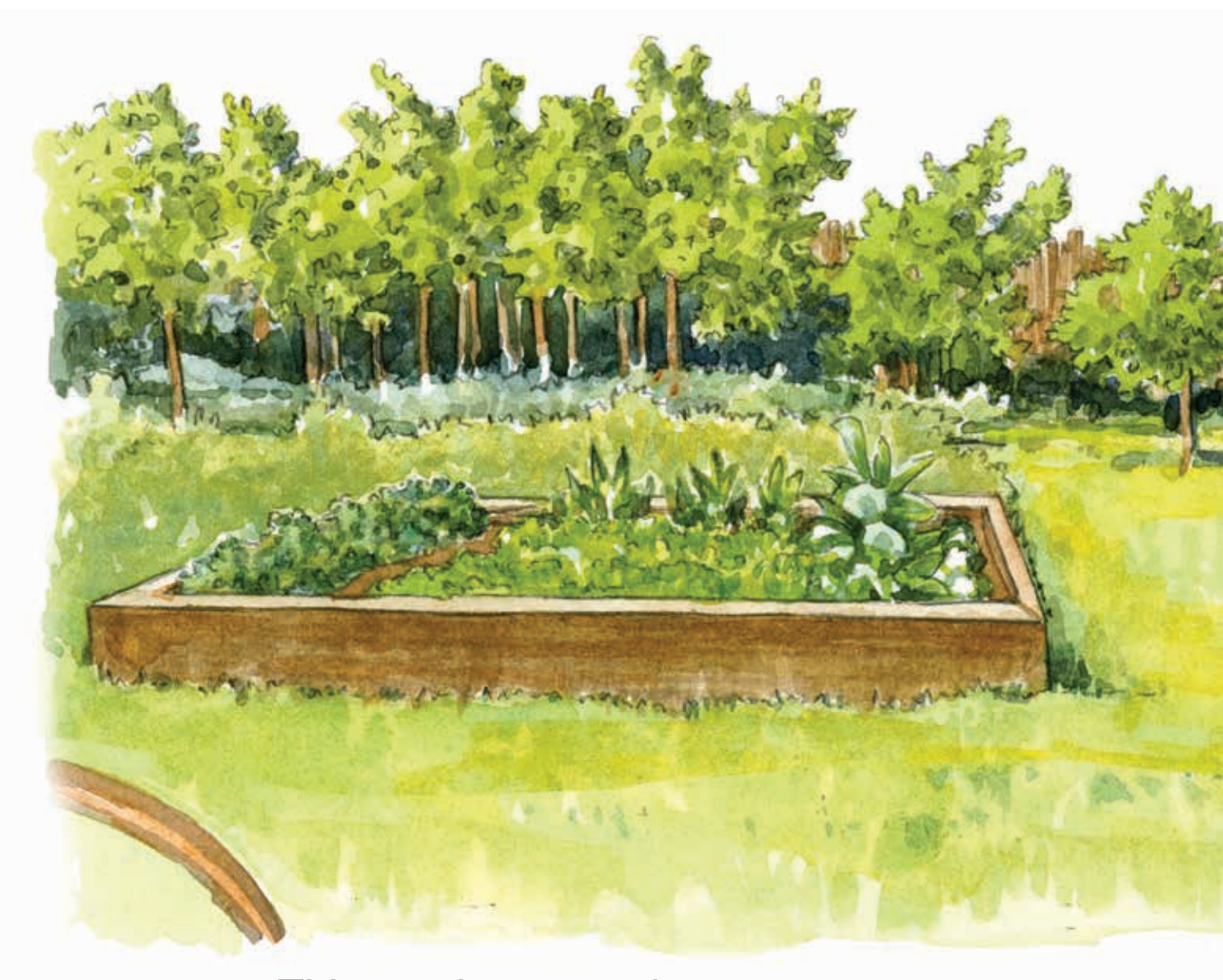
This can be your plan. Go to your plot.