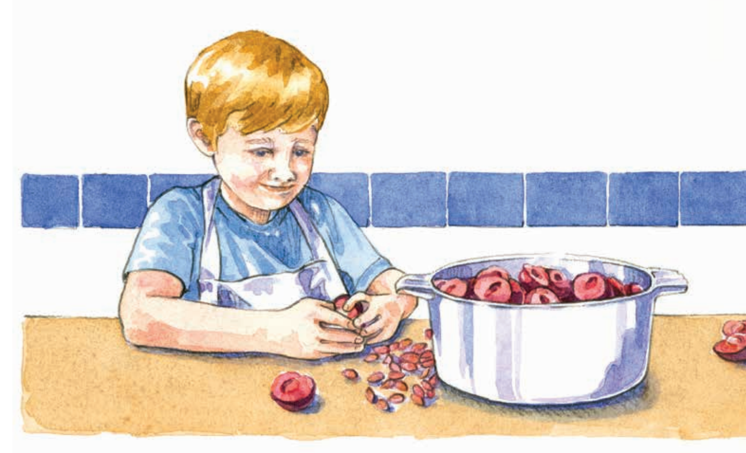
Put on your smock. Get a big pot.