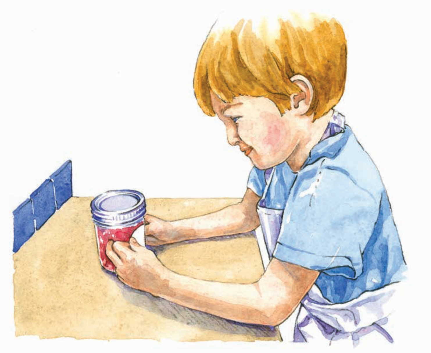
Let the jam set. I bet your jam is very good.