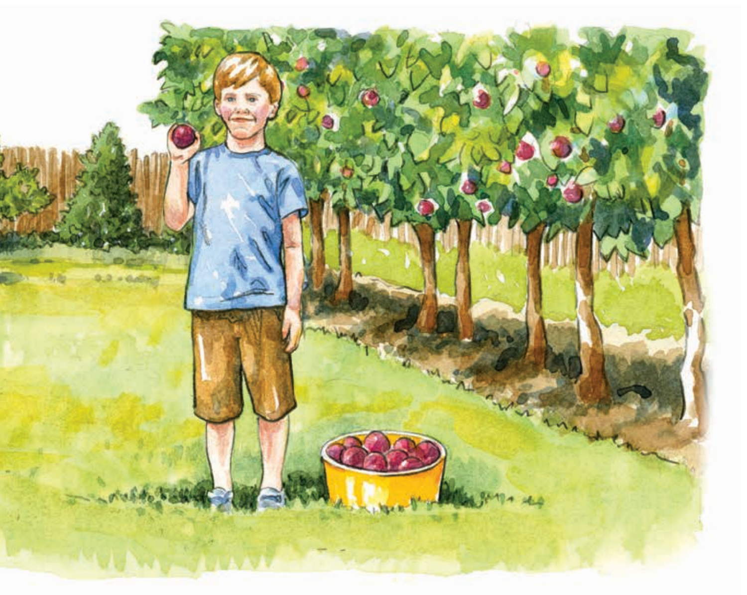
Pluck very big plums. Put them in a tub. Plop! Pluck, plop, pluck. Get a lot.