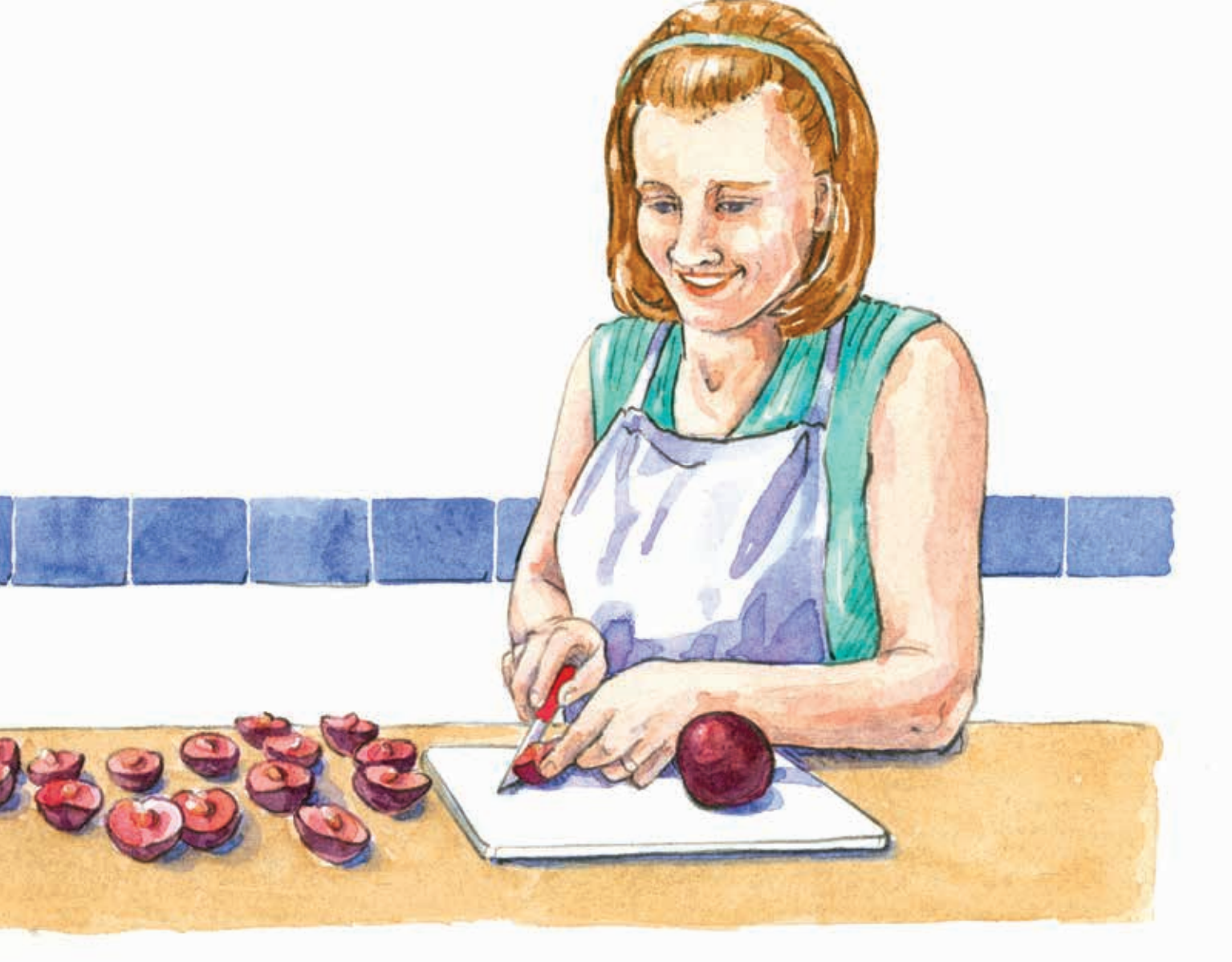
Take out the pits. Put the plums in a pot.